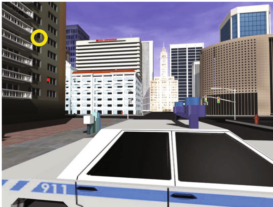
Figure 1. What a participant might see in a representative shared gaze trial. Note that the yellow gaze cursor would typically be moving over the scene, reflecting their partner's changing gaze position. No cursor was displayed in the SV and NC trials. The placement of the target, a single red pixel (the size is exaggerated in the figure for illustrative purposes), varied in position from window to window and building to building. To view this figure in color, please see the online issue of the journal.

tinued for a possible eight shots total. Partners were given identical instructions and were informed as to their communication condition, but they did not communicate prior to starting the experiment. There were 10 practice trials followed by 50 experimental trials.